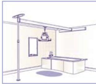
The 2 post Easytrack with wall bracket