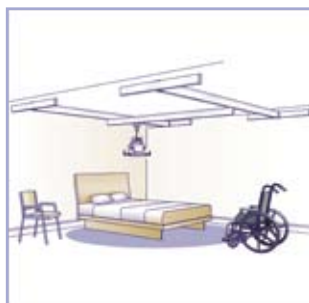
An x-y system without posts and with 4 wall brackets.