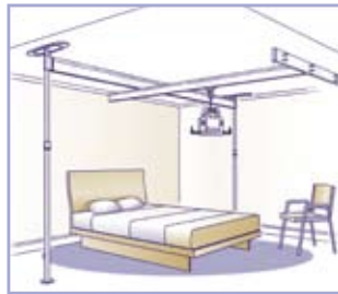
The 3 post Easytrack with wall bracket