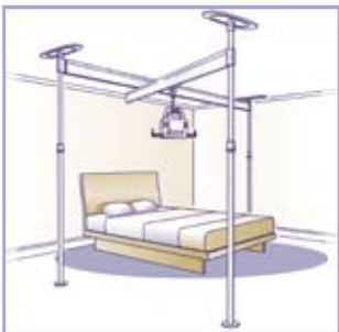
The 3 post Easytrack

The 3 post Easytrack is suited for transfer over a bed or bath and down a room. This system negates the need for a traditional curved track: