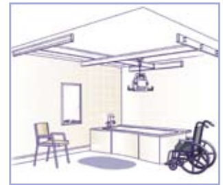
The 3 post Easytrack without posts