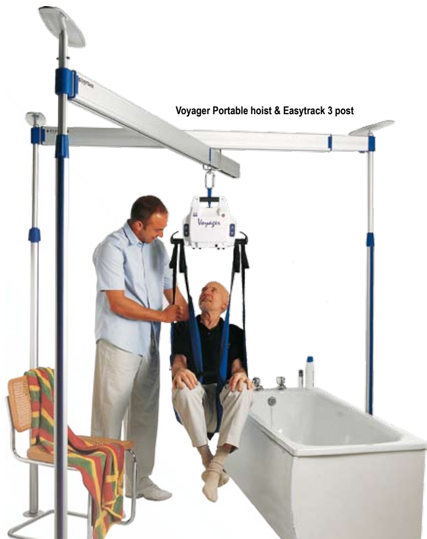
Voyager Portable hoist & Easytrack 3 post

Audible Low Battery Indicator will help ensure the battery will not run-out at a critical moment.