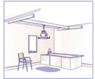
The 2 post Easytrack without posts