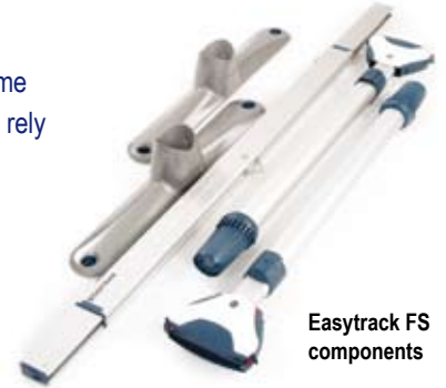
Easytrack FS components