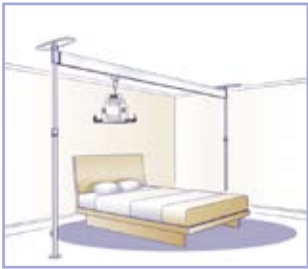
The 2 post Easytrack

The standard 2 post Easytrack is suited for transfer over a bed or bath in a peninsular setting: