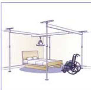
The 4 post Easytrack operates like a traditional x-y system covering all 4 corners of a room. The 4 post is not telescopic