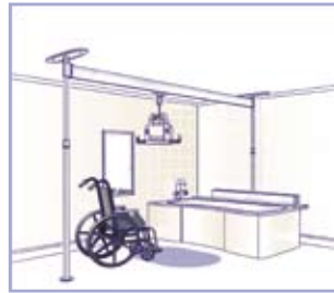
The 2 post Easytrack with bath bracket