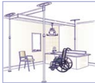
The 3 post Easytrack with bath bracket