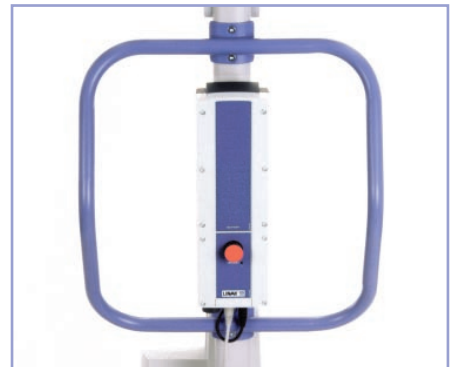
Ergonomic oversized push handle