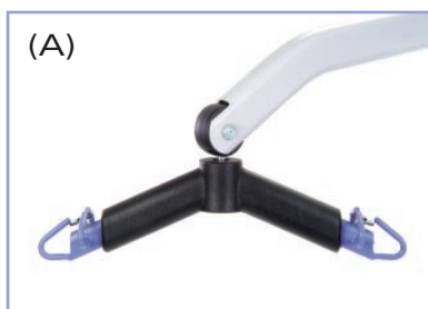
(A) 6-point spreader bar