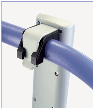
Convenient hand control rest