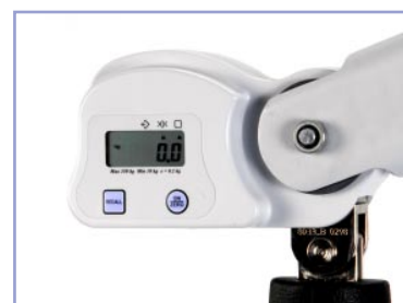
Digital weigh-scale (Class III)

One of the restrictions of using certain lifts is the type of slings you can use on the product. The Presence, however, gives you a choice of sling systems because you can use the conventional 6-point spreader bar (A) or Oxford 4-point positioning cradle (B - powered version shown).