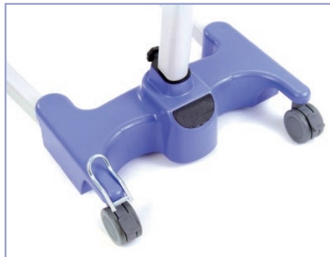
Ergonomic foot push pad